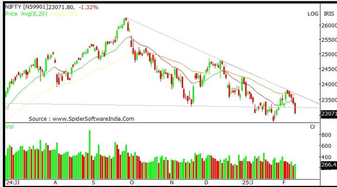
Daily Chart (23,071.80)