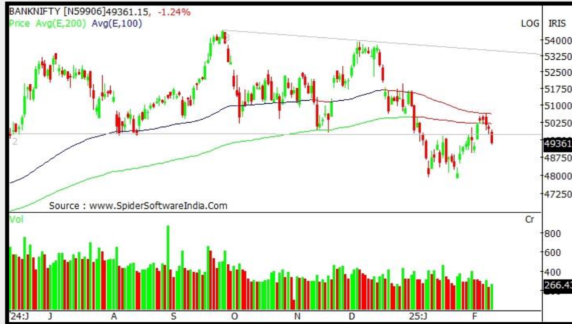
Daily Chart (49,403.40)